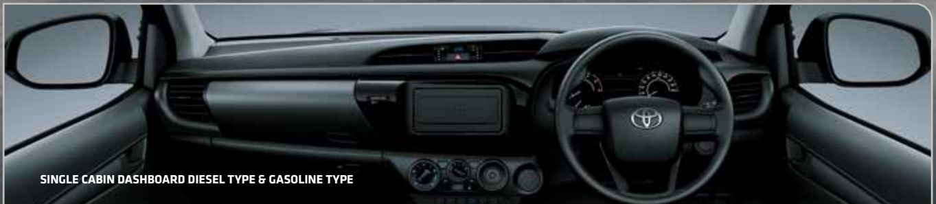
SINGLE CABIN DASHBOARD DIESEL TYPE & GASOLINE TYPE