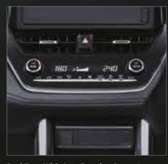
Dual Zone With Auto Function Convenient AC adjustment as the driver and passengers preferences. (All Type)

Elegant Steering Wheel Design. Embellished with silver chrome details to give a more prestigious experience when commanding the road. (All Type)