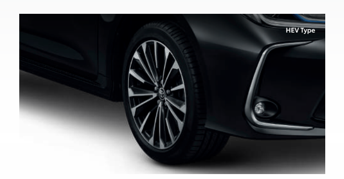
NEW STRIKING 17" ALLOY WHEELS (ALL TYPE)