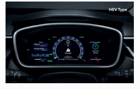
NEW PROGRESSIVE 12.3" COLOR TFT MID (ALL TYPE)

The New Corolla Altis is made for you to stay connected to the world with the notable technology for your Qi wireless charging product.