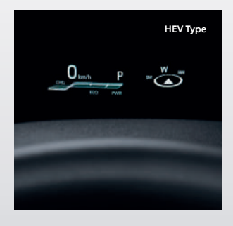
SMART COLOR HEAD-UP DISPLAY (ALL TYPE)