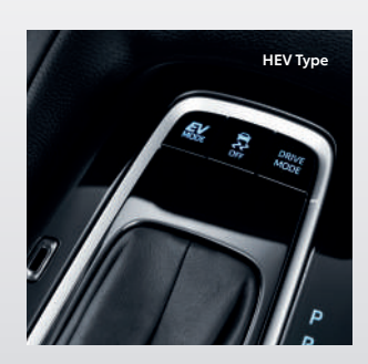
EV MODE (HEV TYPE) & ADAPTABLE DRIVING MODE (ALL TYPE)

Experience a genuinely connected drive through the Integrated Multimedia System that brings you essential car information effortlessly.