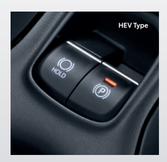
ELECTRONIC PARKING BRAKE (ALL TYPE)