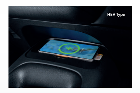
NEW WIRELESS CHARGER (ALL TYPE)

The advanced driving experience of the Toyota Hybrid System greets the future with excellent advantages.