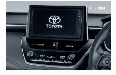
NEW 9" AUDIO DISPLAY WITH SMARTPHONE CONNECTIVITY (ALL TYPE)

Satisfy your journey with the advanced large screen display to show lots of important driving-related information with several stunning options that you can customize.