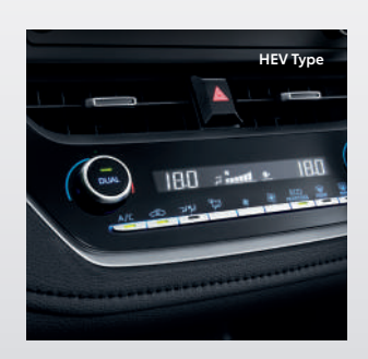
DUAL ZONE AUTO AC (ALL TYPE)