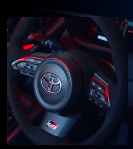
Sleek Steering Switch with Vehicle Information System Control Vital stats & navigation at your fingertips, with easy Audio Control and GR Leather Steering Wheel.