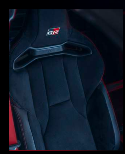
Sport Seat with GR Logo Comfortable leather and ultrasuede material, showcasing adjustments for supportive ergonomics.